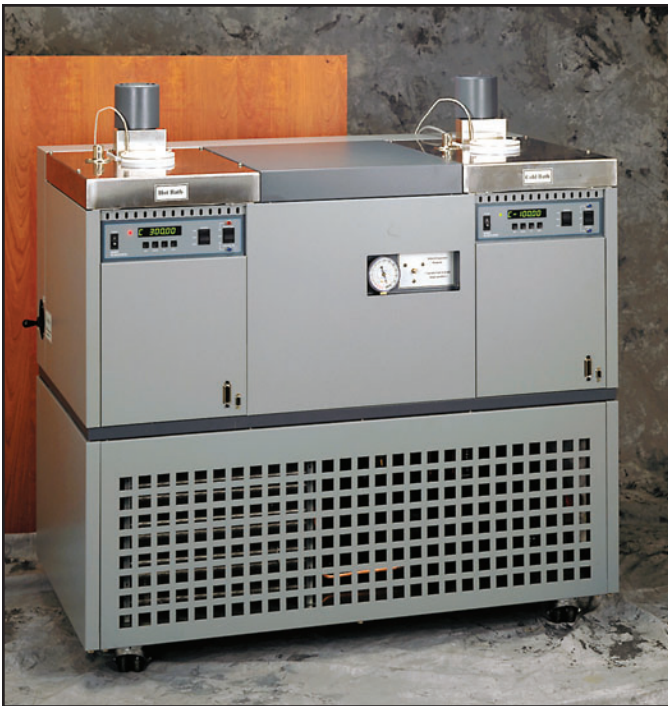
This two-baths-in-one design (Model 7013) is a favorite in many labs.

Get the latest product information at www.hartscientific.com