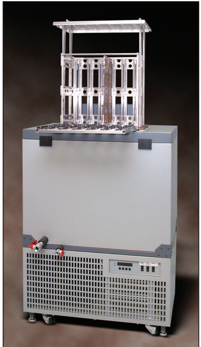
A wide variety of sizes and shapes can be used to accommodate unique inserts.