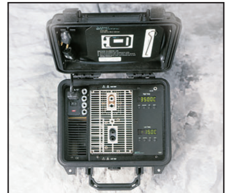
The 9009 is built into a small, lightweight, rugged enclosure that holds everything you need and comes in black or yellow.

Two blocks in one unit, a total range of -15^{\circ}\text{C} to 350^{\circ}\text{C} , portability, durability, versatility, performance, and automation. Hart Scientific delivers it all.