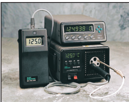
Calibrations using dry-wells can be improved by using an external reference such as the 1502A Tweener Thermometer.

The point is that the accuracy specs of your dry-well are based upon how the manufacturer calibrates it. If you're relying on those specs, you need to use the dry-well the same way they do — with a good, snug fit at the bottom of the well.