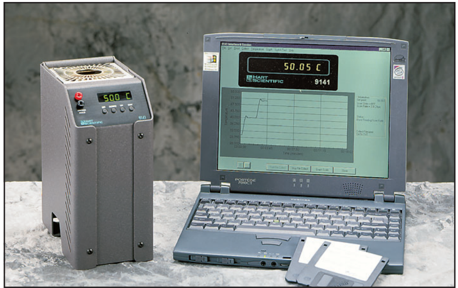
Hart not only includes an RS-232 port on the 9103, 9140, and 9141, but also gives you free Windows control software (Interface-ii) to automate your dry-well.